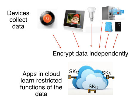
Figure 1: Application of Multi Input Functional Encryption to IoT cloud security.

On the other hand, Intel SGX is widely available for use in commodity chips, whereas academic systems like Sanctum are not. Ideally, we would have the best of both worlds. Hardware software isolation is an evolving technology, and the research contributions of this work should be viewed as a paradigm for building functional encryption with both present and future generations of SGX-like systems.